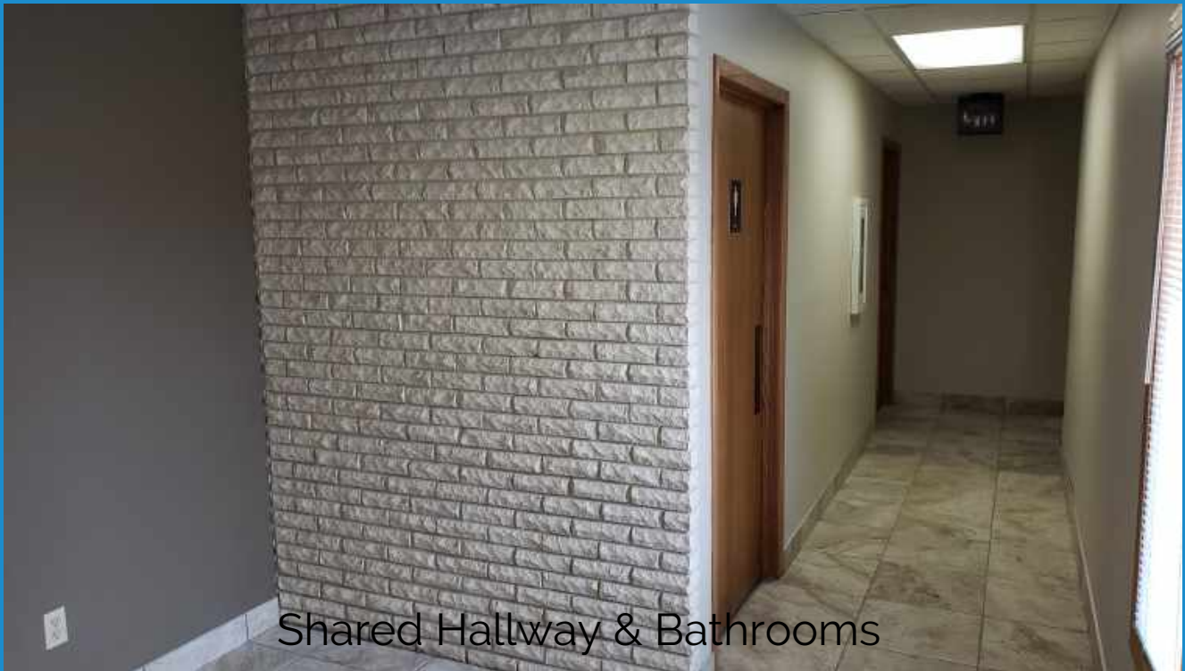
Shared Hallway & Bathrooms