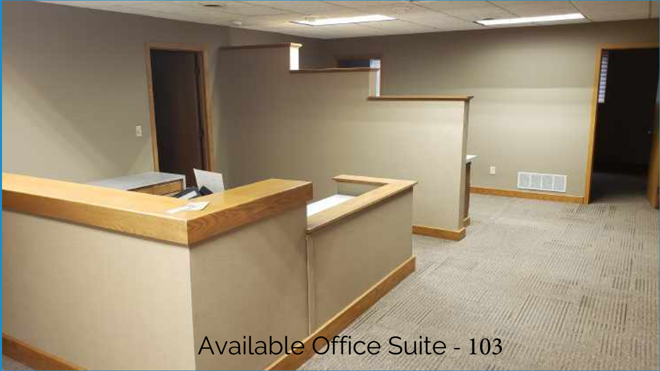
Available Office Suite - 103