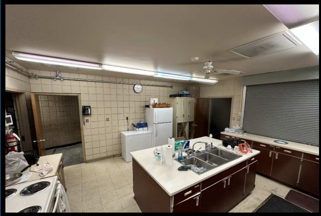
Kitchen off Sanctuary