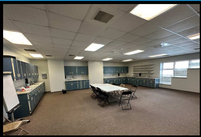
Example upstairs classroom