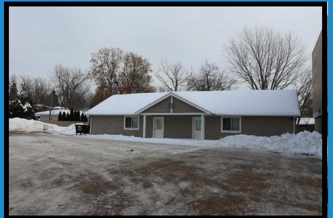
Modular building in back parking lot

Ron Nelson, CCIM C: 605-728-7600 E: Ron@Ncommercial.com