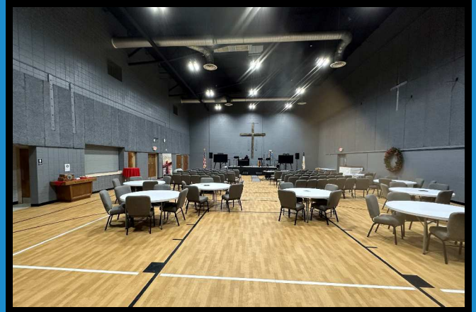
Sanctuary view back to front