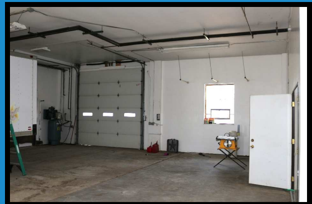
East 12ft Overhead Door from inside