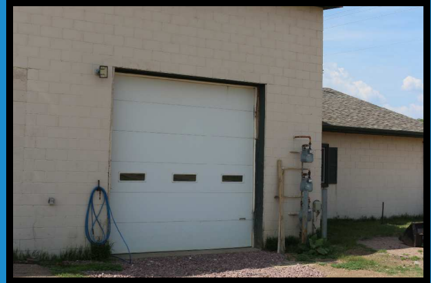
East 12ft Overhead Door