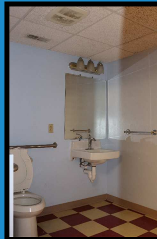
Office Space Bathroom