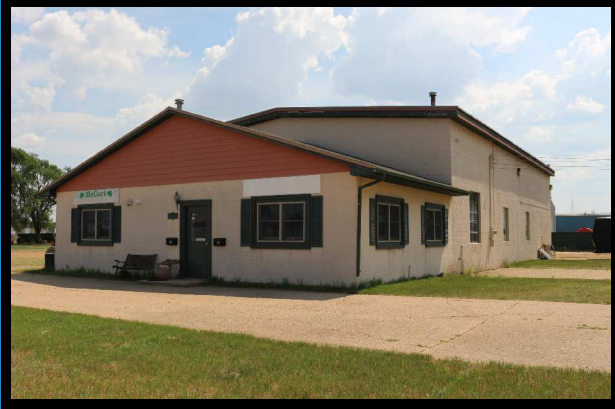
North Entrance / Front of Building