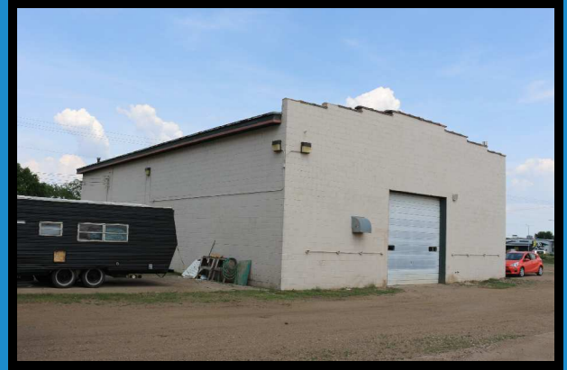
South 12ft Overhead Door