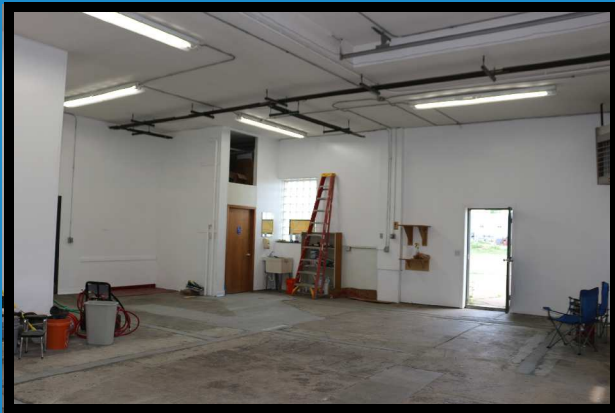
Warehouse/Shop Space - East Entrance