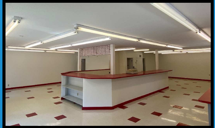
Front Interior View