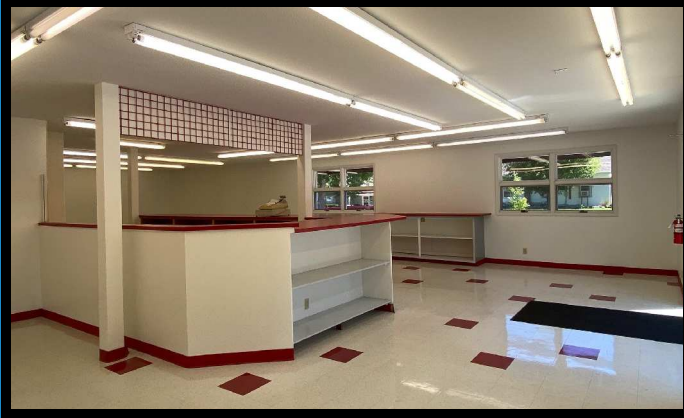
Front Interior View