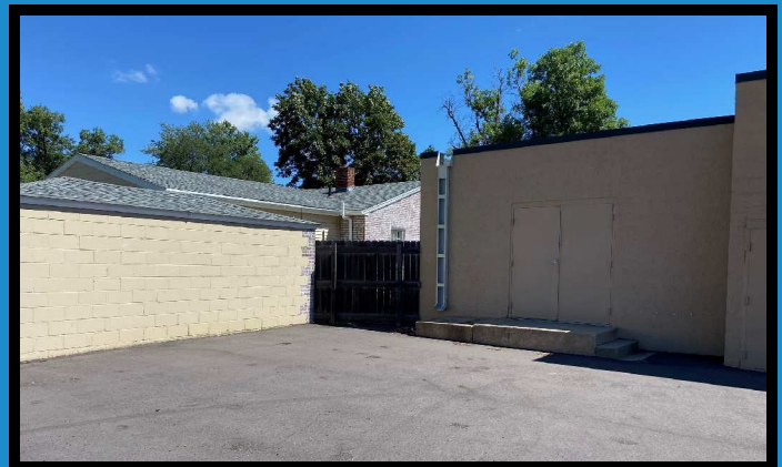
Exterior Loading Doors