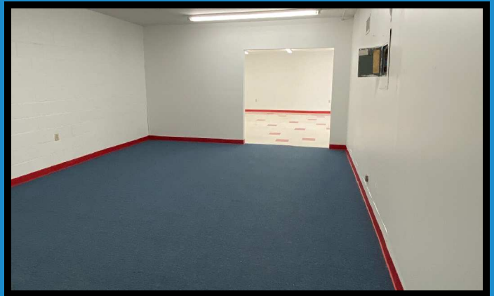
Additional Storage or Floor Space